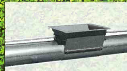
Unloading Auger shown installed with slic