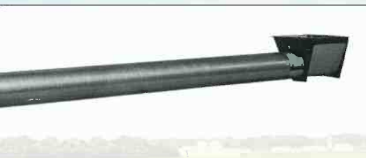
shown with standard features in- ad motor mount and belt-guard.