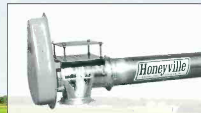
8" Bin Unloading Auger including hopper, overhead