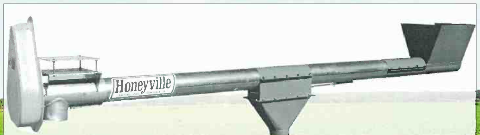
Model 67A— 6" distributing auger shown with 18" x 18" hopper and optional Intermediate discharge with slide gate and outlet transition.