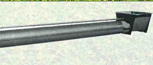
own with optional thru-hopper de gate control assembly.