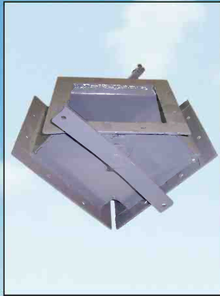
Two Way Valve (Y)