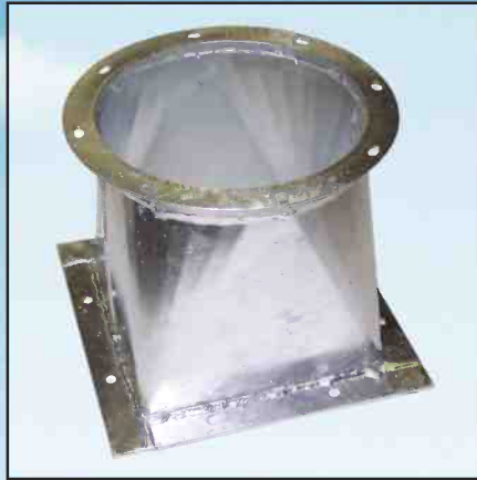
Square to Round Adapter