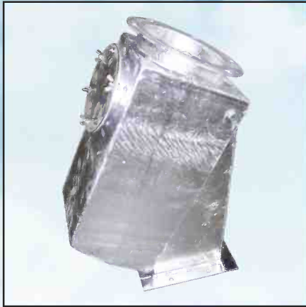
Adjustable Cushion Box