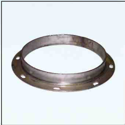
Angle Flange Ring