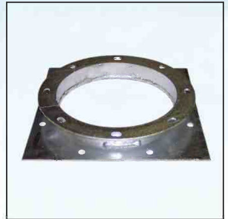
Round Hat Inlet