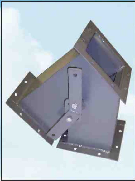
Two Way Valve (Offset)