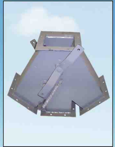
Three Way Valve