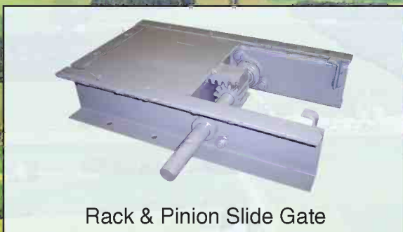
Rack & Pinion Slide Gate